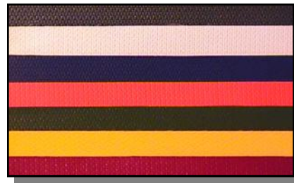
Special Colors Available