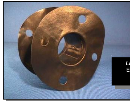
LFP™ CrossFilm™ EXPANSION JOINT APPLICATION

Ensure Safety! Use thick LFP™ CrossFilm™ technology.