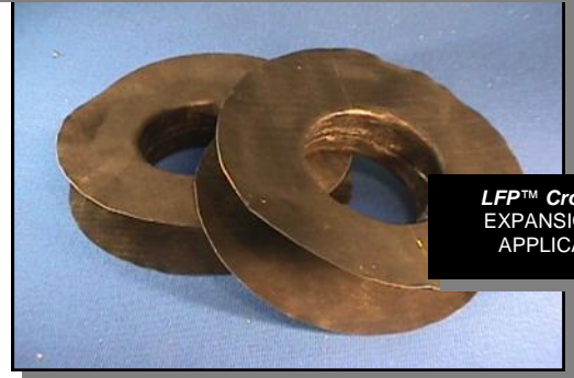
LFP™ CrossFilm™ EXPANSION JOINT APPLICATIONS