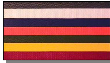
Many Colors Available