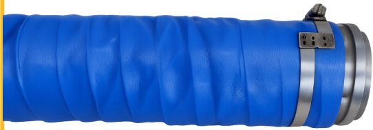
Coupler with Bridge Clamp Connection.

With a variety of factory-installed cuffs and flanges, Chemduit® can be tailored to match your specific end connection requirements. From quick-install cuffs to heavy-duty bolted flanges, our solutions are engineered for performance, efficiency, and reliability.