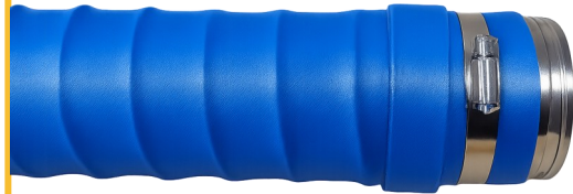
Factory-Installed Cuff with Coupler and Hose Clamp.