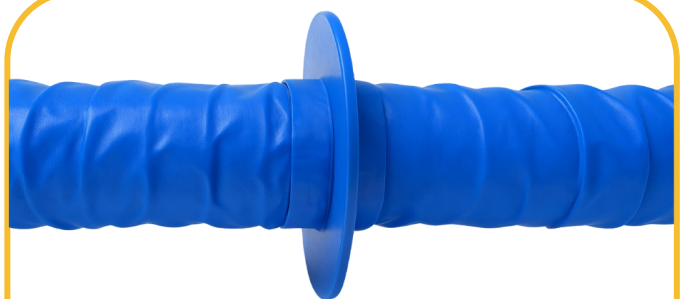
Factory-Installed Flange, Heat-Sealed to Matching Factory-Installed Flange.