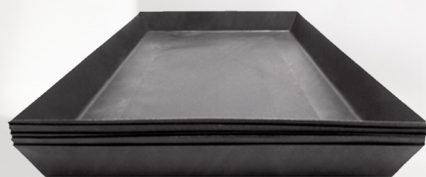
EVERBASKET™, NESTING BASKET CREATED TO SAVE VALUABLE SPACE

*Additional sizes available upon request.