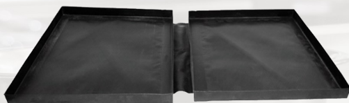
EVERBASKET™, HINGED BASKET