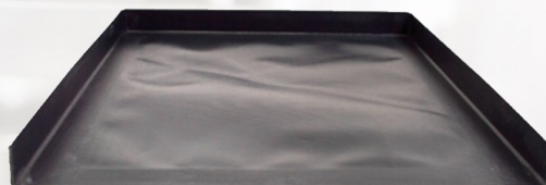
EVERBASKET™, THREE-SIDED BASKET