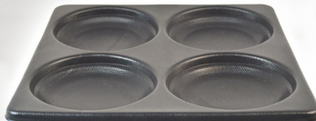
EVERFORM™ 4 CAVITY