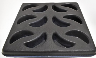
EVERFORM™ 12 CAVITY