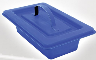
EVERFORM™ LOAF PAN

Low-Cost tooling allows for quick and easy prototyping of new designs.