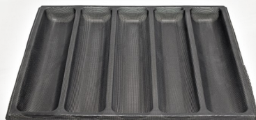
EVERFORM™ PERFORATED BREAD FORM FOR SUPERIOR HOT-AIR CIRCULATION

* Perforation patterns and size can be adjusted to meet customized demands of heat transfer.